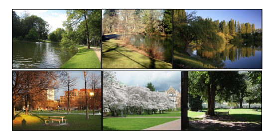
Figure 1: Images from SUN 397 [32] illustrating class ambiguity. Top: (left to right) Park, River, Pond. Bottom: Park, Campus, Picnic area.

As the number of classes increases, two important issues emerge: class overlap and multilabel nature of examples [10]. This phenomenon asks for adjustments of both the evaluation metrics as well as the loss functions employed. When a predictor is allowed k guesses and is not penalized for k - 1 mistakes, such an evaluation measure is known as top-k error. We argue that this is an important metric that will inevitably receive more attention in the future as the illustration in Figure 1 indicates.