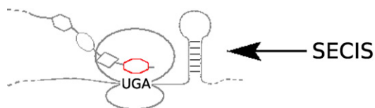
Fig. 1. The translation of UGA into selenocysteine. Termination of translation is inhibited in the presence of the SECIS element.

insertion, i.e. generating new amino acid sequences containing selenocysteine. This rare amino acid was discovered as the 21st amino acid [6], giving another clue to the complexity and flexibility of the mRNA translation mechanism. Selenocysteine is encoded by the UGA codon, which is usually a stop codon encoding the end of translation. It has been shown [6] that in case of selenocysteine, termination of translation is inhibited in the presence of a sequence of nucleotides, the SECIS element, which forms a hairpin-like structure in the 3'-region after the UGA codon (see Fig 1). It is argued in [3] that modifying existing proteins by incorporating selenocysteine instead of a catalytic cysteine is an important problem for catalytic activity enhancement and X-ray crystallography.