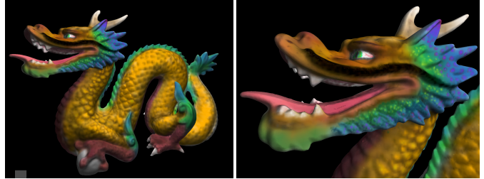
Figure 1: Our interactive 3D paint application stores paint in an octree-like structure with an effective resolution of 2048^3 (using 15 MB of GPU memory). Our system paints and renders this 817k polygon model with an octree texture at 15–20 fps and supports quadlinear filtering.

We unify memory usage for adaptive paint resolutions and mipmapping. The page table hierarchy allows us to share physical tiles between mip levels when the adaptive resolution is coarser than or equal to the mip level's resolution. This is non-trivial for two reasons. First, since we are using a "node-centered" scheme, as opposed to traditional "cell-centered" textures, the filter support is different (see Figure 2R). Second, since we are allocating texels in blocks, many texture samples do not intersect the surface and thus will never be assigned colors. It is important that these samples do not contribute to the filtering used for coarsening. Thus we identify "valid" texels by recording the resolution level at which each texel has been written into the alpha channel. This allows us to refine from low resolutions to higher resolutions while still identifying which samples were actually painted at a specific resolution.