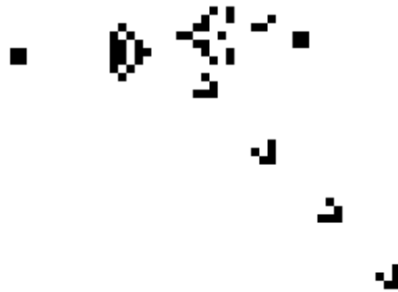
Figure 9.2: ... in action.