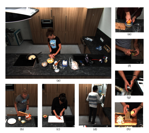
Figure 1. Fine grained cooking activities. (a) Full scene of cut slices , and crops of (b) take out from drawer , (c) cut dice , (d) take out from fridge , (e) squeeze , (f) peel , (g) wash object , (h) grate

While impressive progress has been made, we argue that the community is still addressing only part of the overall activity recognition problem. When analyzing current benchmark databases, we identified three main limiting factors. First, many activities considered so far are rather coarsegrained, i.e. mostly full-body activities e.g. jumping or waving . This appears rather untypical for many application domains where we want to differentiate between more finegrained activities, e.g. cut (Figure 1a) and peel (Figure 1f). Second, while datasets with large numbers of activities exist, the typical inter-class variability is high. This seems rather unrealistic for many applications such as surveil-