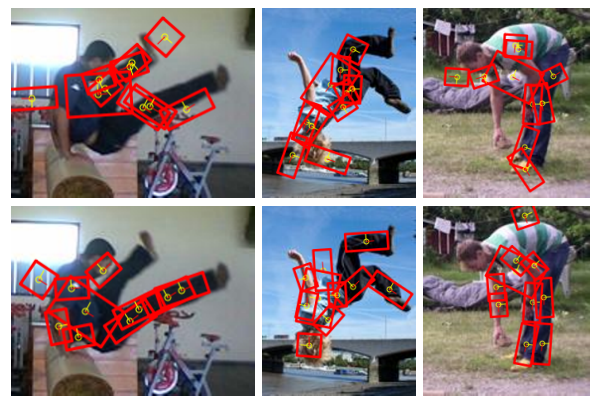
Figure 3. Typical failure cases on the LSP dataset. Shown are the results by our method (row 1) and PS [3] (row 2).