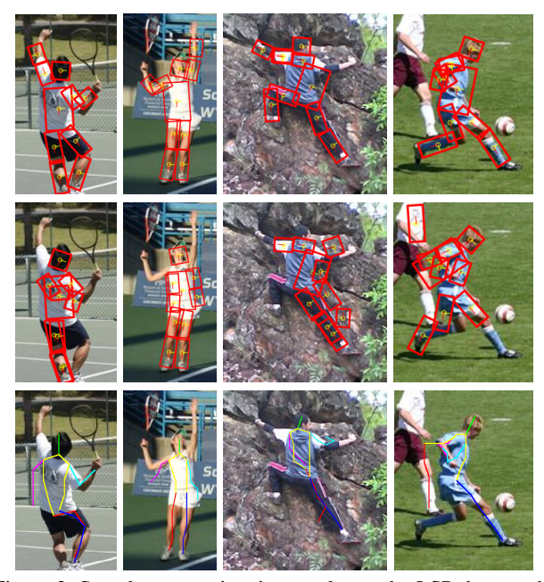
Figure 2. Sample pose estimation results on the LSP dataset obtained by our method (row 1), PS [3] and the method of [26] (row 3). Modelling long-range part dependencies by our method results in better performance on highly articulated people.