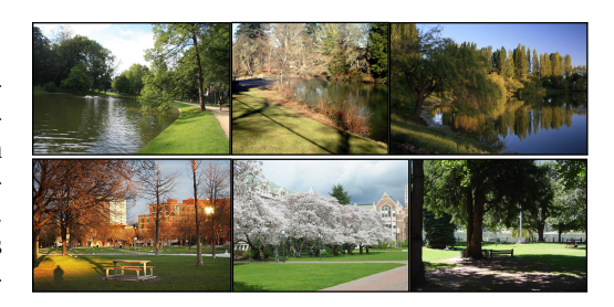
Figure 1: Images from SUN 397 [29] illustrating class ambiguity. Top: (left to right) Park, River, Pond. Bottom: Park, Campus, Picnic area.

As the number of classes increases, two important issues emerge: class overlap and multilabel nature of examples [9]. This phenomenon asks for adjustments of both the evaluation metrics as well as the loss functions employed. When a predictor is allowed k guesses and is not penalized for k-1 mistakes, such an evaluation measure is known as top-k error. We argue that this is an important metric that will inevitably receive more attention in the future as the illustration in Figure 1 indicates.